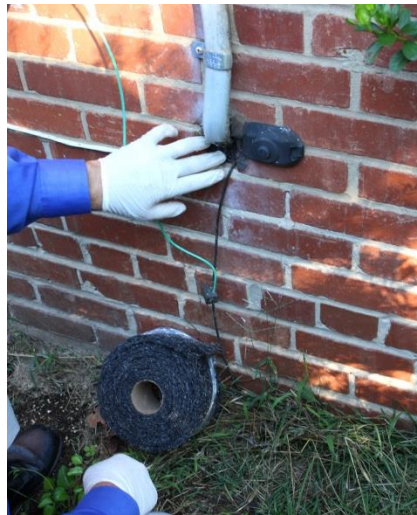
Fig 2. Using non-corrosive materials from Xcluder™ to prevent rodents from gaining access to the interior of a building.