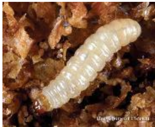
Fig 2. Indianmeal moth larvae.