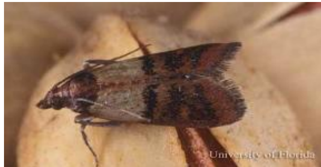
Fig 1. Indianmeal moth adult.

The Indianmeal moth is the most common food-infesting moth found in schools, homes, and grocery stores. Infestations often start when larvae are unknowingly brought in on contaminated foods including whole grains, dried cereals, and nuts. Adult moths are about ½-inch long with a distinct grey and red pattern on the forewings (Fig 1). Mature larvae (Fig 2) appear as creamy white caterpillars measuring about ½-inch long. Infestations are commonly confirmed after adults are seen flying, or finding larval silk webbing on contaminated foods. Control measures include those mentioned above. For more information on identification and control of Indianmeal Moths, click here . For additional information on identification and control of other pantry pests, click here .