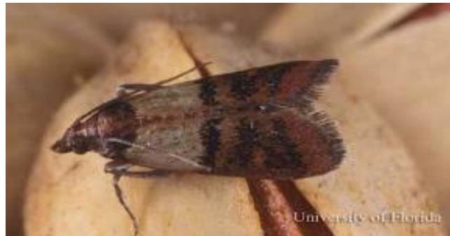
Fig 1. Indianmeal moth adult.

The Indianmeal moth is the most common food-infesting moth found in schools, homes, and grocery stores. Infestations often start when larvae are unknowingly brought in on contaminated foods including whole grains, dried cereals, and nuts. Adult moths are about ½-inch long with a distinct grey and red pattern on the forewings (Fig 1). Mature larvae (Fig 2) appear as creamy white caterpillars measuring about ½-inch long. Infestations are commonly confirmed after adults are seen flying, or finding larval silk webbing on contaminated foods. Control measures include those mentioned above. For more information on identification and control of Indianmeal Moths, click here . For additional information on identification and control of other pantry pests, click here .