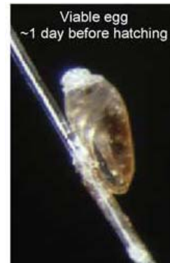
Viable egg ~1 day before hatching