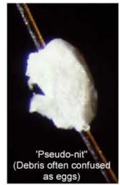
“Pseudo-nit” (Debris often confused as eggs)