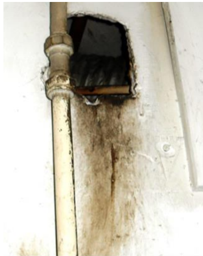
Fig 2. Rub marks made from repeated entry into a structure by rodents.