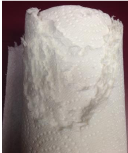
Fig 1. Chewing damage to paper towel roll by field mouse.