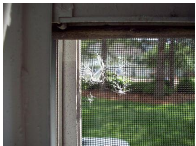
Fig 2. Damaged screen that can create an easy access point for flying pests to enter a structure.

For additional information regarding filth fly prevention click here.